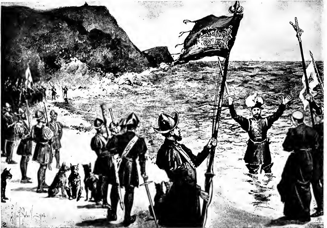
1. Panciaco tells Balboa of the South Sea—From De Bry, "India Occidentalis," 1594. 2. Balboa takes possession of the Pacific Ocean.